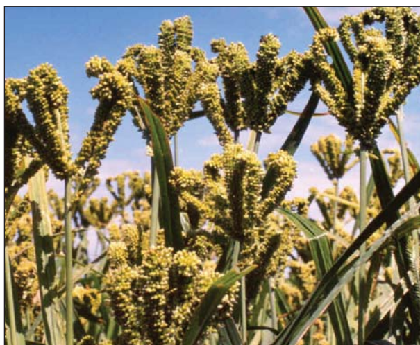
Finger millet ( Eleusine coracana (L.) Gaertner)