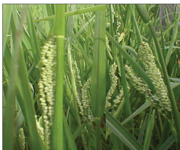
Kodo millet ( Paspalum scrobiculatum L.)