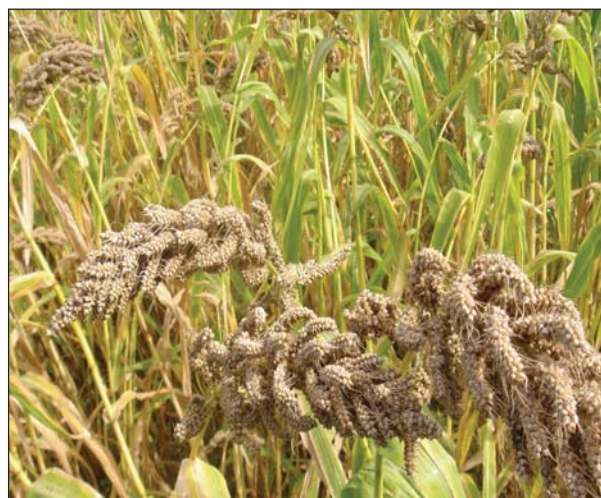
Barnyard millet ( Echinochloa colona L.)