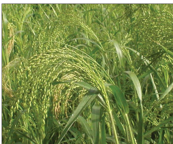
Proso millet ( Panicum miliaceum L.)