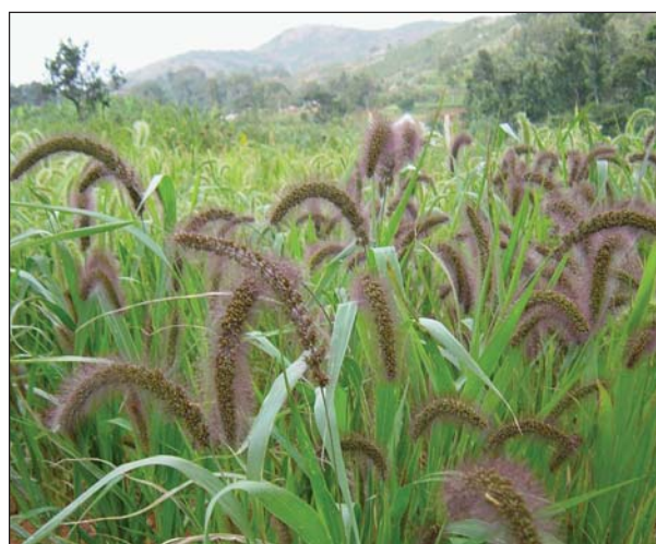
Foxtail millet ( Setaria italica (L.) Pal)