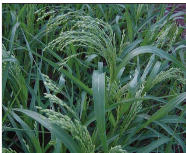
Little millet ( Panicum sumatrense Roth ex Roemer & Schultes)